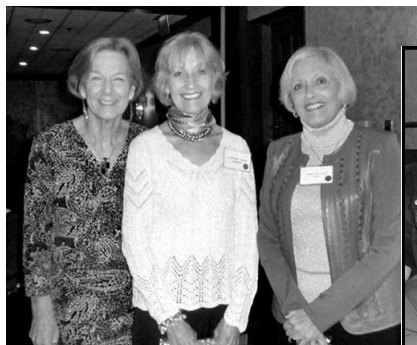
CLASS OF 1956