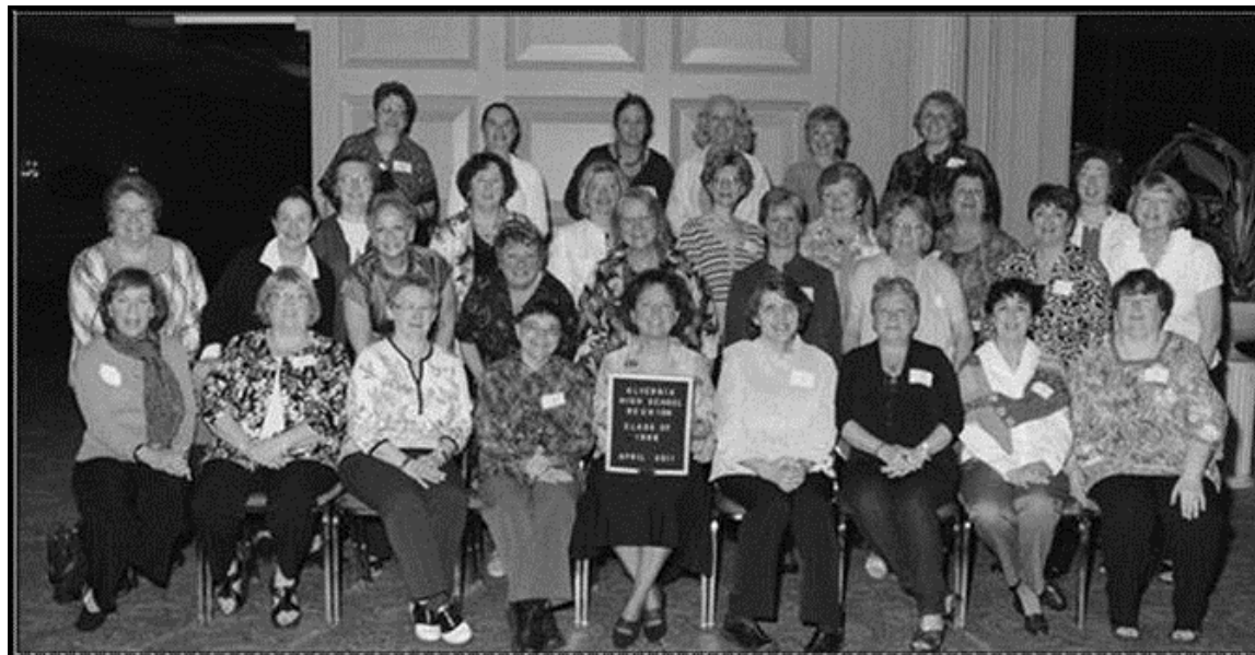
CLASS OF 1966—45TH YEAR REUNION—APRIL 10, 2011

This picture was flawed in the last issue of Alvernia Alive so it is being included once again. Sorry for the error!