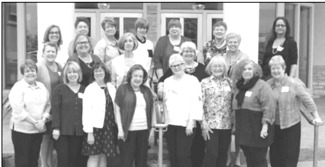
Class of 1971