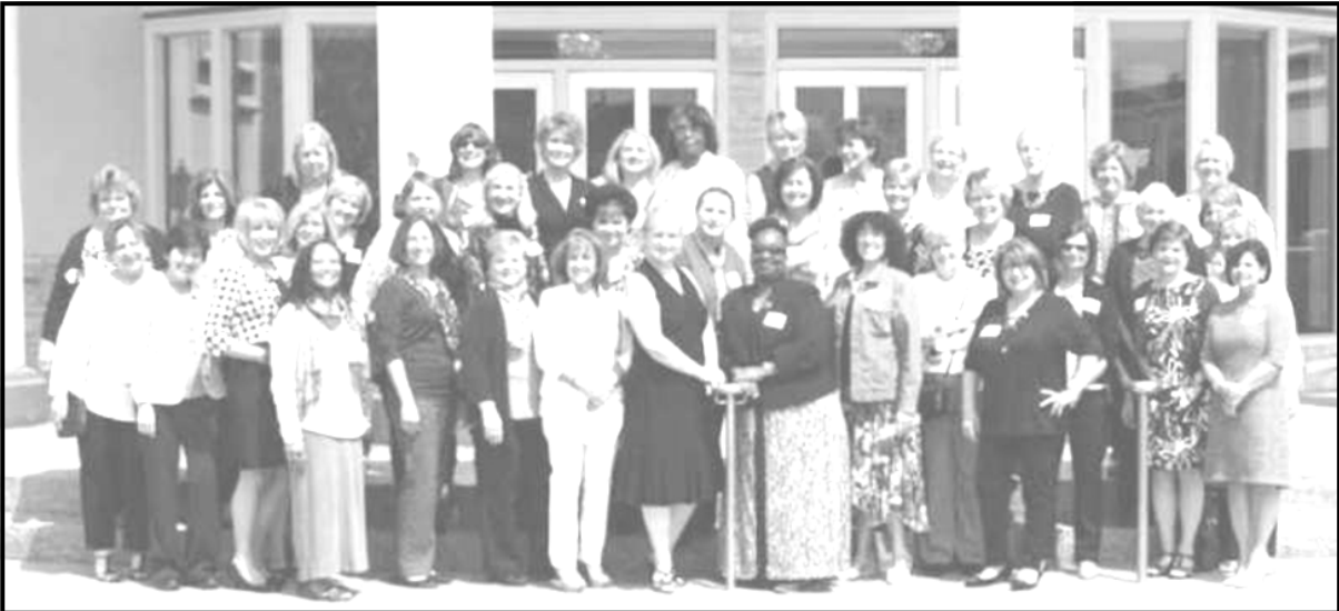
Class of 1970