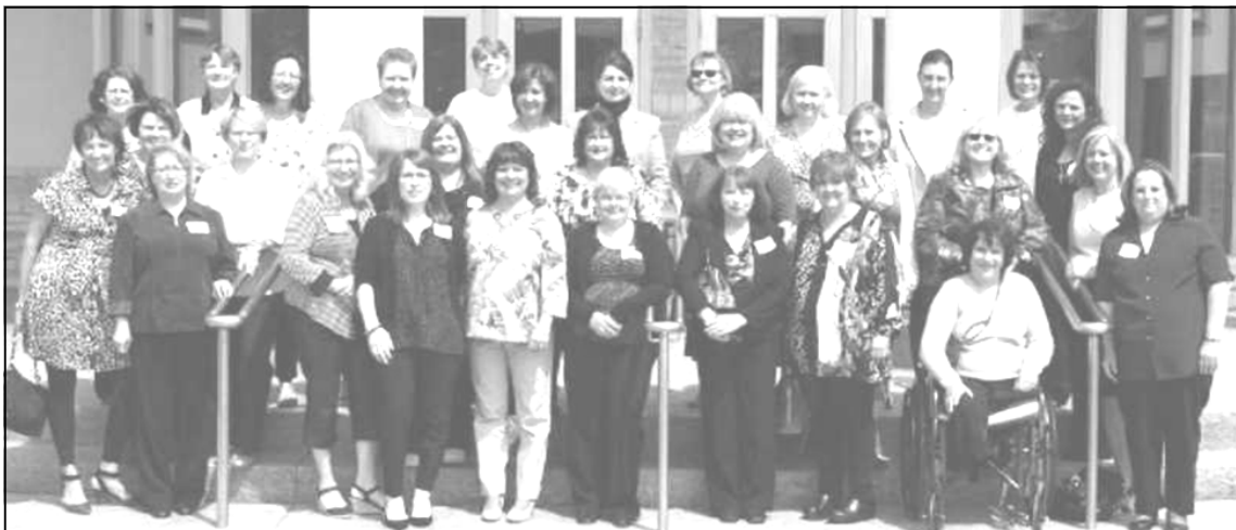
Class of 1975