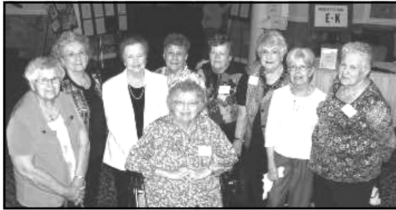
Class of 1951