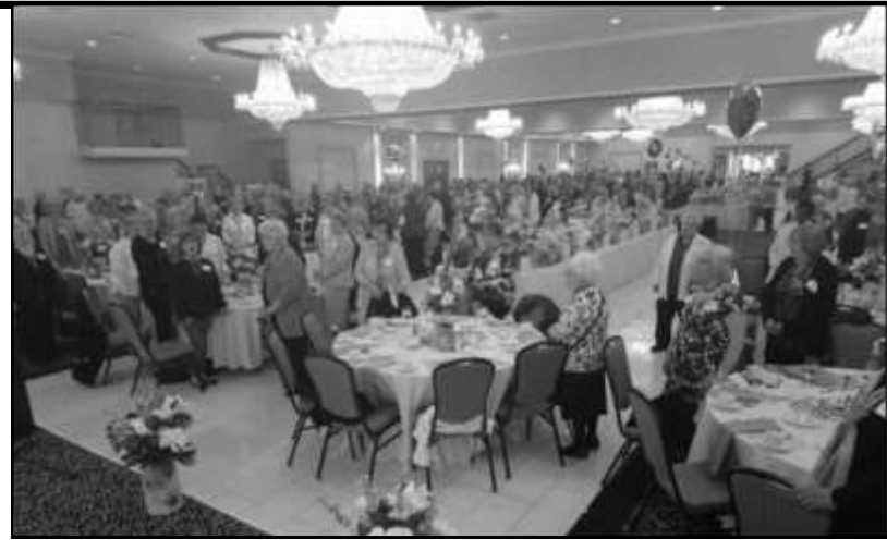
27th Annual Alvernia Alumnae Luncheon