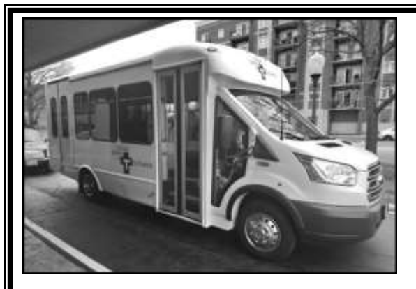
Some of our Sisters traveled in this bus from Milwaukee!