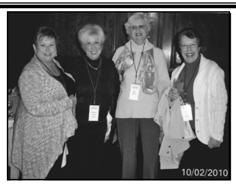
Class of 1958 Pictures