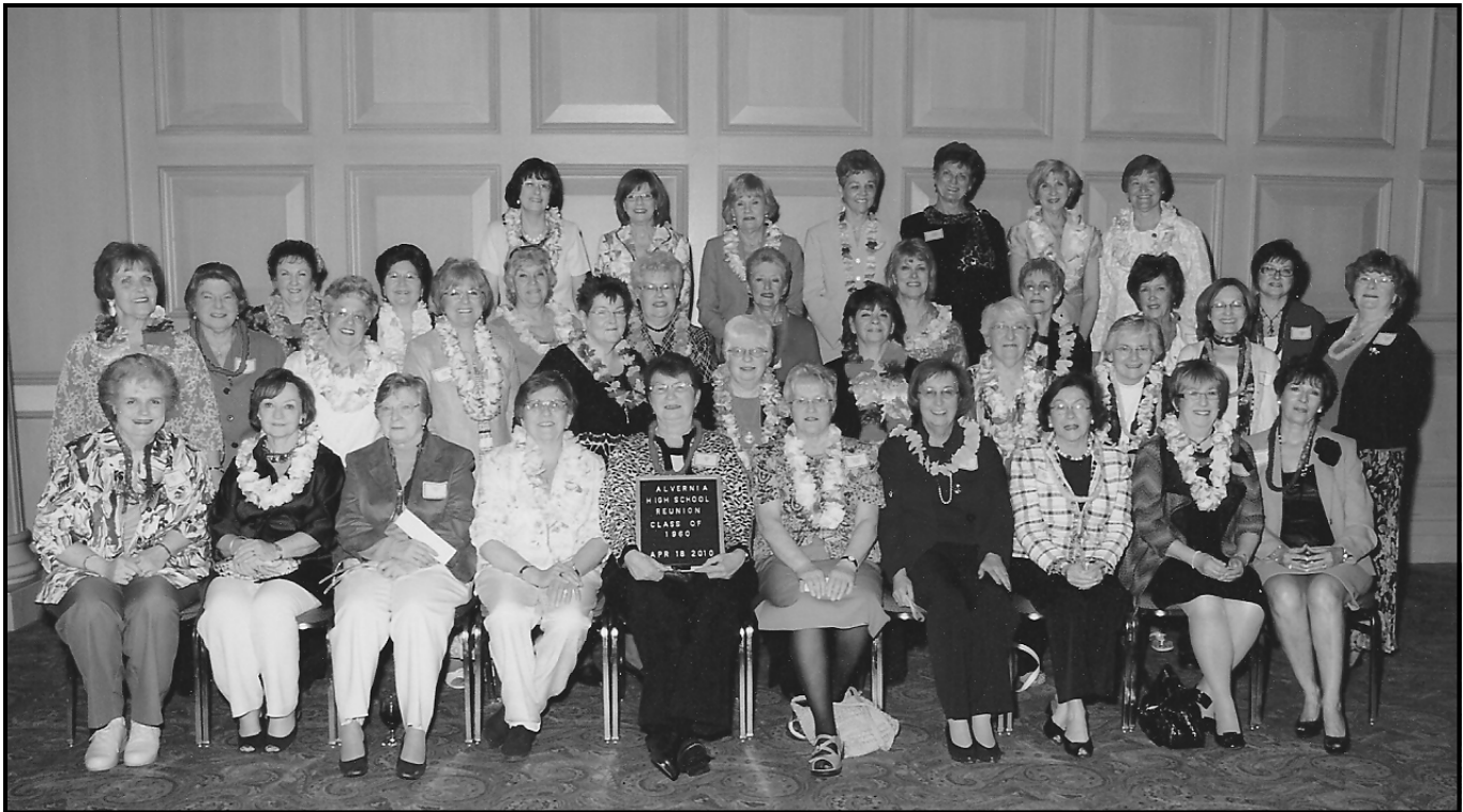
The Class of 1960 at the first of their 50th Year Reunion Celebrations! See list of names on page 13.