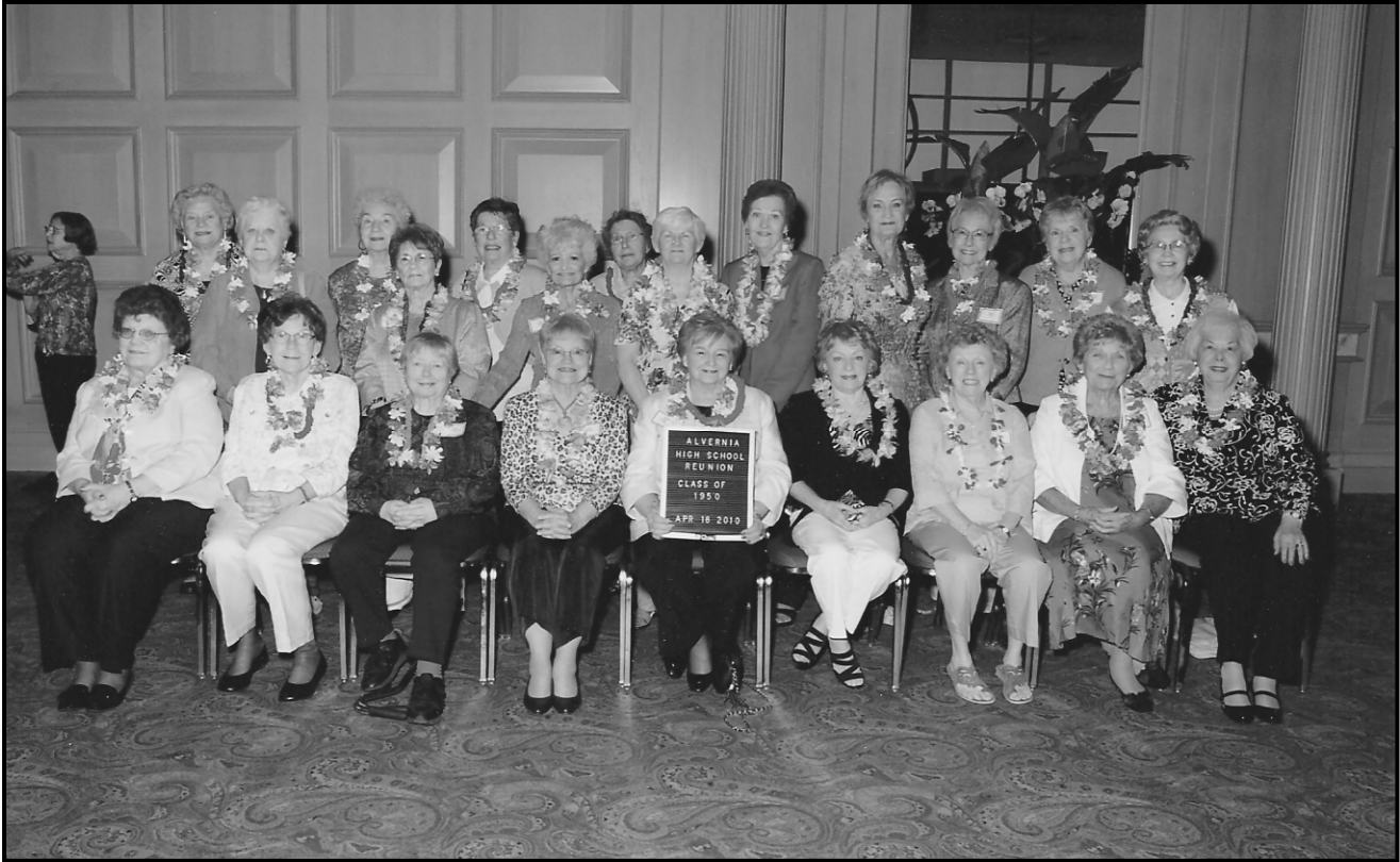
THE CLASS OF 1950 CELEBRATES 60TH YEAR REUNION See list of names on page 13