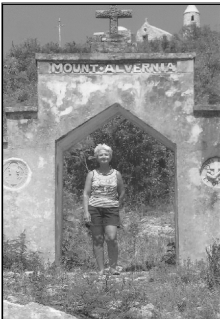
Entrance to the Trail up to “The Hermitage” on Cat Island .

We are a bit “less alive” with our dear Sister Vitalis gone but how graced we were to have her for so long.”