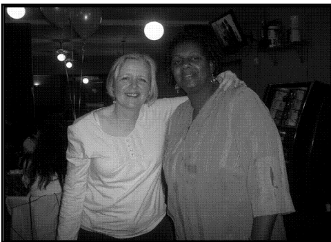
The Class of 1980 celebrated their 30th Class Reunion at Dino's on Higgins Saturday, April 9, 2010.