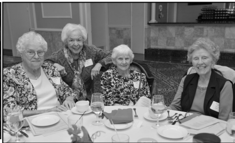
Class of 1950