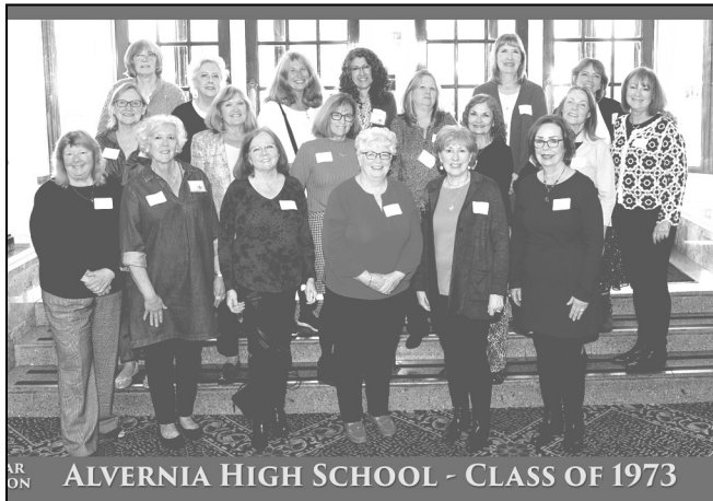
Celebrating 100 Years of Alvernia.