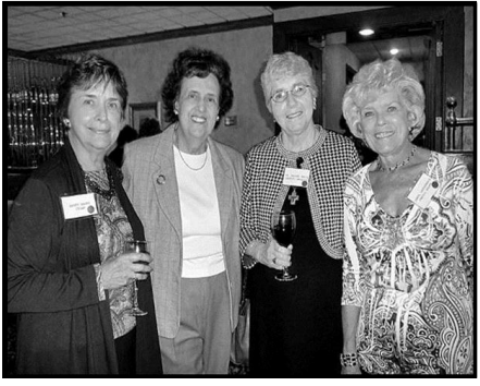
This picture was flawed in the last issue of Alvernia Alive so it is being included once again. Sorry for the error!